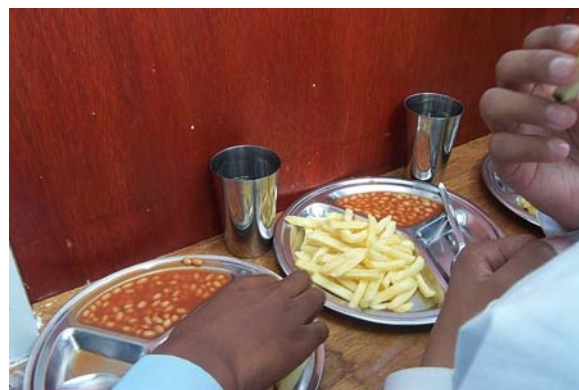
Beans and chips langar at the gurdwara

Many photos show visits to places of worship , which are often used for examination coursework.