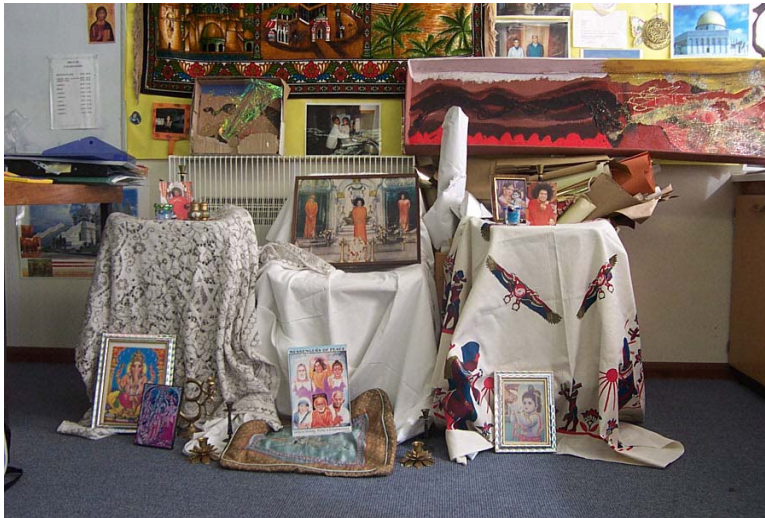
In his first RE lesson a devotee of Sathya Sai Baba makes a shrine for him

The galleries have become a significant contribution to social, moral, spiritual, cultural and citizenship education in the school.