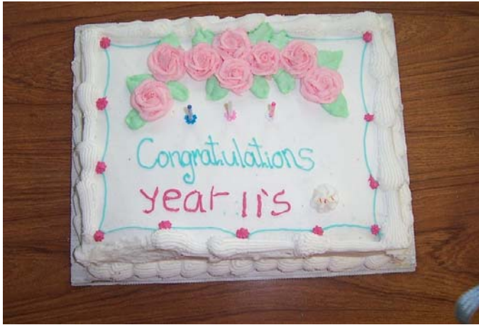
Year 11's leaving cake

There are pictures of gifts to the classroom, such as a crucifix a boy brought back from Cyprus.